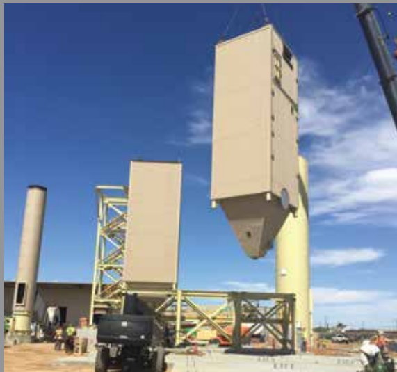
Medical Waste Incinerator System

SEI is licensed to work in the contiguous 48 states.