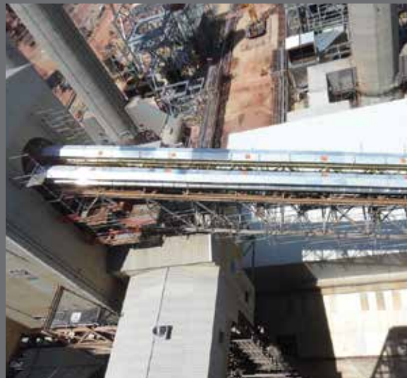
Material Handling System