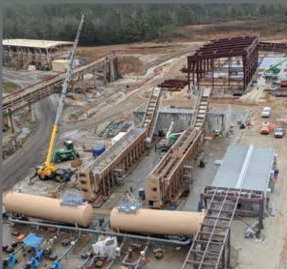
Waste Water Treatment