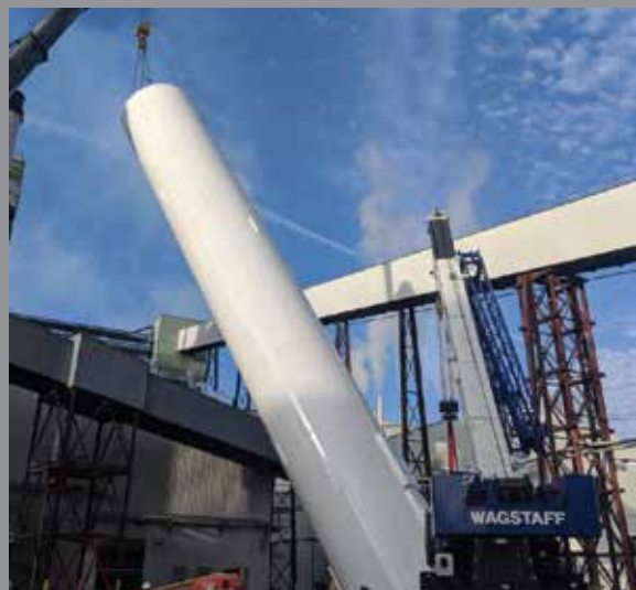
Dry Sorbent Milling System